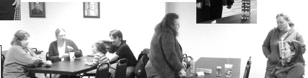
Game Night participants enjoying the evening.