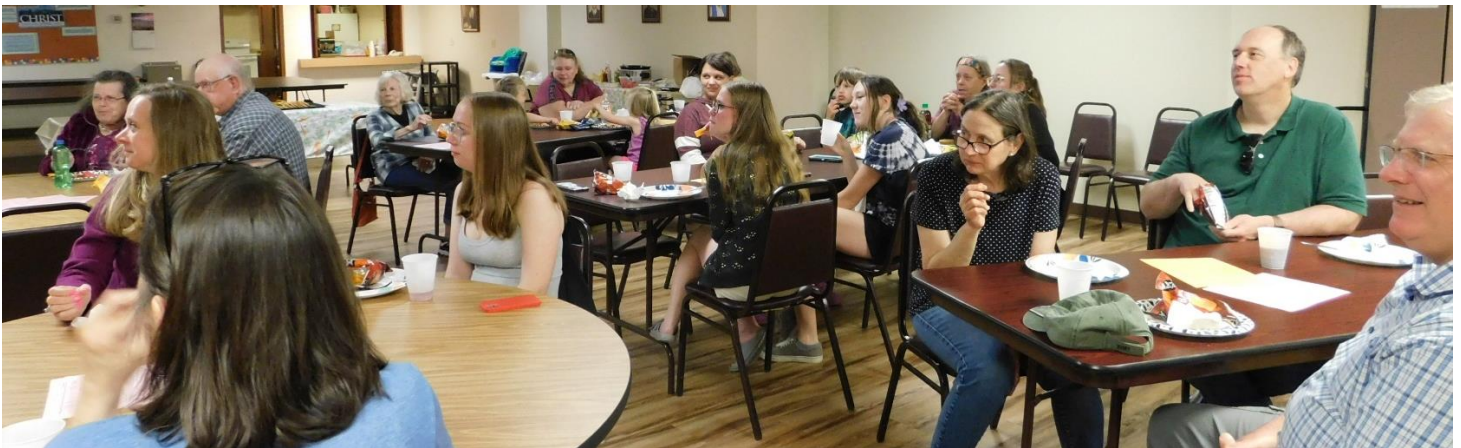
All-Ages Vacation Bible School