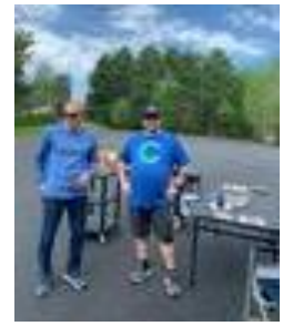
Free Sale/Open House