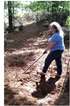
Clearing Trail and Woods Area