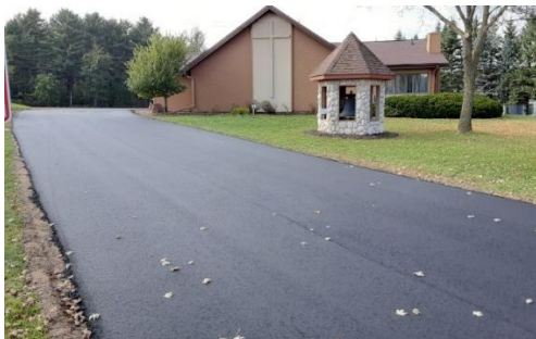
Phase One of the parking lot resurfacing is complete.